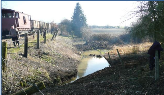
"Rocks by Rail" site at Cottesmore

Over the past few months, we have held several work parties in and around Melton. These have mostly been on the river clearance and work boats 'Badger' and 'Mole'. We have also been busy at the "Rocks By Rail" site at Cottesmore and on the small stretch of canal in Oakham (see next item below).