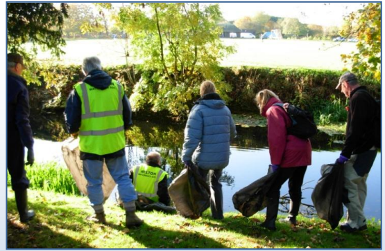
"Excuse our backs!"