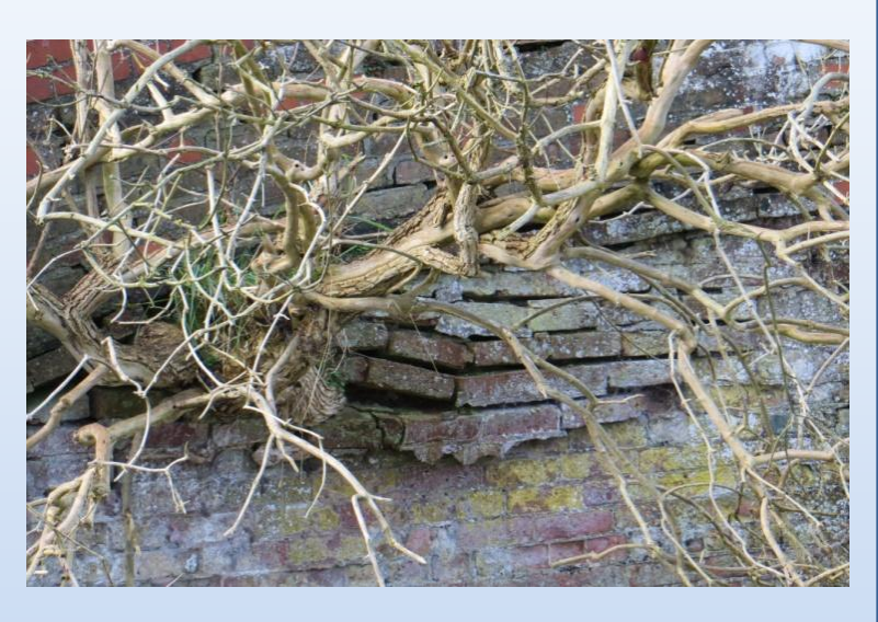
Tree bursting the brickwork of Eye Kettleby Lock Bridge

The adjacent double arch bridge is also looking worse for wear with repairs to the brickwork and repointing needed in addition to the removal of saplings and weeds.