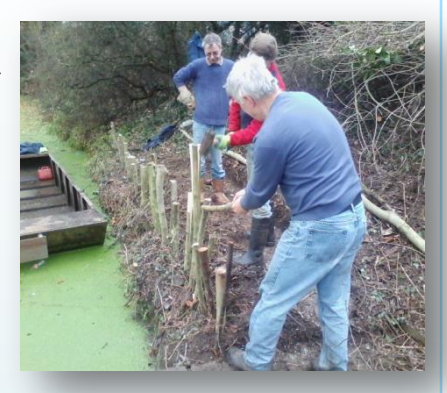
Staking the bank ready for weave and backfill ....

The site also happens to be next to our slipway which is on land belonging to the Town Estate. What could be better?