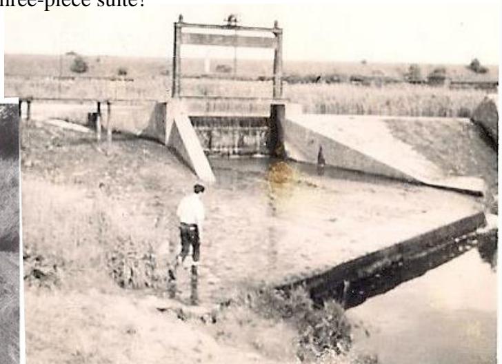
Above: Guillotine sluice gate at Eye Kettleby Lock circa 1950s