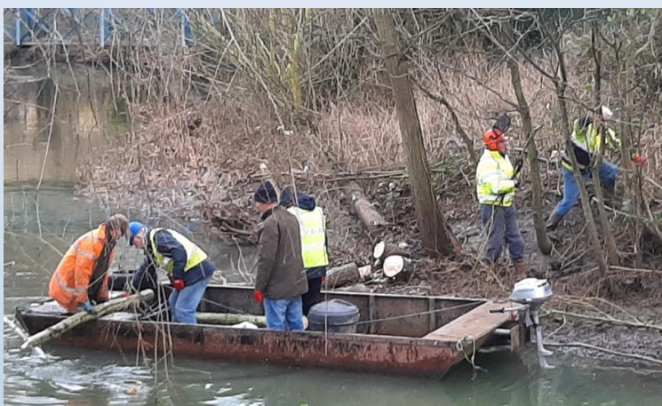
Rest? Rest? Who wants to rest? Volunteers back at work after the Christmas/New Year break ...

The society's undying gratitude goes out to those few individuals, who made this happen, and you know who you are. Personally, I never doubted the volunteer's ability to pull this off, and I now know we are up to tackling anything – but maybe we should give them a rest before suggesting something else!